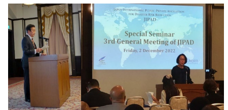
The JIPAD 3rd General Meeting (Dec, 2022)