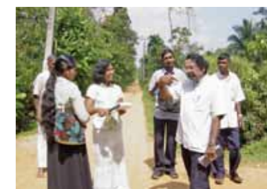
Field Survey in Town Watching

Town-Watching for DRR is a simple and practical tool for efficiently implementing community-based hazard mapping in local communities. The major benefit of Town-Watching is that the physical involvement of participants (in such activities as walking, observing, mapping by hand, and discussing findings) enables them to better develop a concrete image of DRR activities.