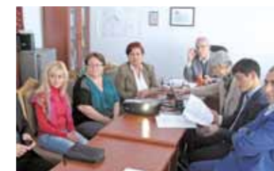
DRR Policy Peer Review FY2014 in Armenia

Since 2009, ADRC has been conducting DRR Policy Peer Reviews to help develop the DRR capacity of ADRC-member countries by promoting information sharing and facilitating efforts to strengthen relationships among member countries. This program had been conducted in seven countries as of March 2015.