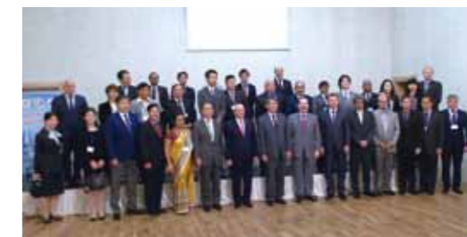
ACDR 2017 in Baku, Azerbaijan

ADRC convenes an annual international conference, the Asian Conference on Disaster Reduction (ACDR). Attended by disaster risk management officials from member countries, as well as disaster experts from international organizations, ACDR aims to promote the sharing of information and ideas, and to enhance partnerships among participating countries and organizations. ACDR is expected to facilitate for implementation of the priority actions of the Sendai Framework for Disaster Risk Reduction 2015-2030.