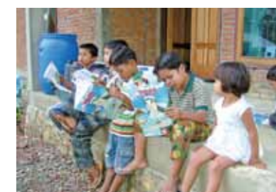
Inamura no Hi Story for Eight Asian Countries

Inamura no Hi is the story of a man who noticed the early warning signs of a large tsunami and led his fellow villagers to high ground by burning harvested rice sheaves. This story can be traced to the time of the Ansei-Nankai Tsunami (1854), which claimed around 3,000 lives in the coastal areas of Western Japan. ADRC has developed tsunami awareness educational materials based on the Inamura no Hi story for eight Asian countries. These materials are available for download on the ADRC website.