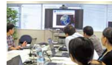
GIS Lecture for VR

ADRC has been receiving Visiting Researchers (VR) from member countries since 1999. As of March 2015, 87 officials from 26 member countries have taken part in this program. During their stay, Visiting Researchers learn about Japan's advanced DRR knowledge and technologies and its international cooperation in this field. Visiting Researchers are expected not only to contribute to DRR capacity-building efforts in their own home countries, but also to further promote cooperation between their countries and ADRC.