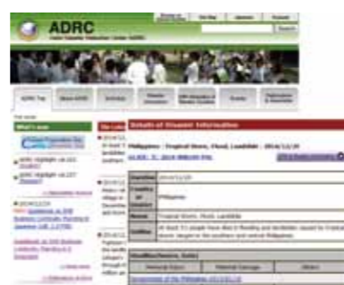
Latest Disaster Information

ADRC has developed a database of disaster information that it publishes on its website in order to serve as a clearinghouse of disaster information from various sources since 1998. Summarized information with direct links to the original data sources enables the rapid search and retrieval of information. The database provides a brief summary of disasters (dates, locations, and descriptions), outlines of damage status, and links to information categorized as either reports/articles, geographic data, emergency relief information, urgent reports from ADRC member countries, and graphic information. Such information is continually updated as it becomes available.