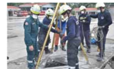
Urban Search and Rescue Training

The Singaporean government holds an annual training course for search-and-rescue professionals, and has included trainees from outside Singapore in this event. Training is provided on the search-and-rescue expertise required in urban disaster situations. To utilize Singapore's expertise and facilities, ADRC has been inviting around 50 fire fighters and rescue workers from member countries to participate in this training course annually since 2001.