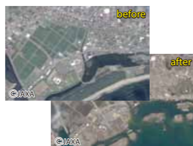
Satellite Images (the Great East Japan Earthquake)

The Sentinel Asia Project was launched in 2006 to establish a disaster risk management system in Asia using satellites. ADRC receives emergency observation requests from member countries and other organizations that participate in collaborative projects. The Disaster Management Support System is also a part of this Sentinel Asia project, and through it ADRC offers maps and satellite images, as well as disaster information, to the Asia Pacific region.